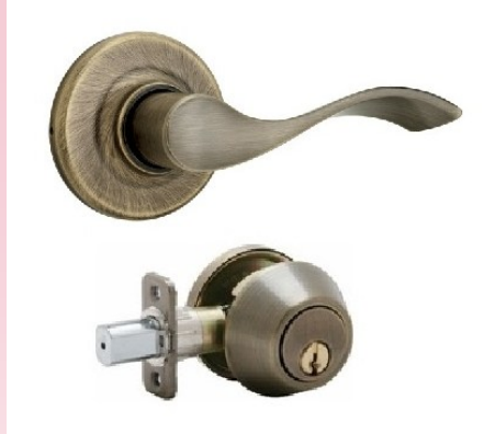
T803+D2800-01-AB “Marco Polo” Cylindrical entrance leverset 60mm backset for door up to 53mm thickness in Antique Brass finish