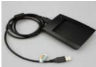
Card Reader / Issuing Device