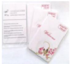
"Marco Polo" RFID Card- Mifare 1