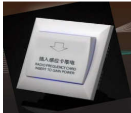
Energy Saver—"Marco Polo" Energy saver switch (30 amps) activated with Mifare card only.

Marco Polo RFID proximity card hotel lock, aluminum reader / lever handle with escutcheon design, Mifare 1 keycard, European mortise lock case, auto deadbolt, with cylinder for emergency metal key override, AAA batteries approx. for 1 year operation depends on frequency of use.