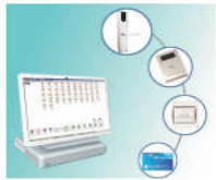
Software: Windows XP, Windows 7, Windows 8