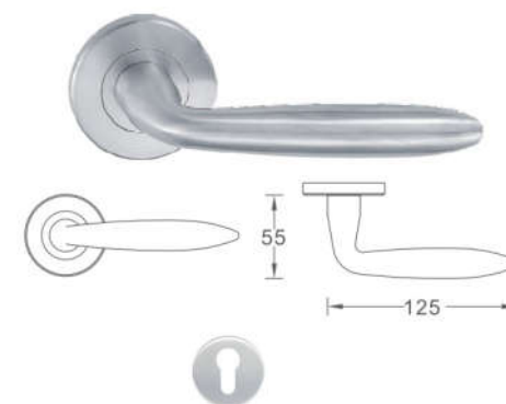
Marco Polo Stainless Steel Lever Handle on Rosette