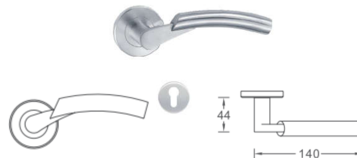
Marco Polo Stainless Steel Lever Handle on Rosette